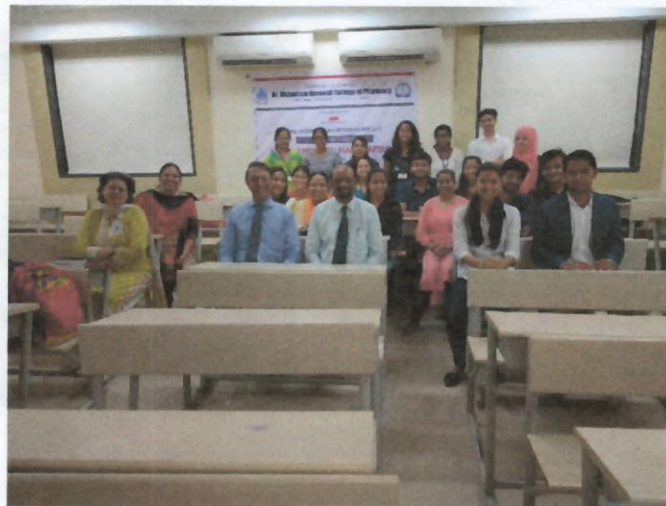
Group members of ACG associated Capsules Pvt.Ltd along with Faculty and MPharm. students