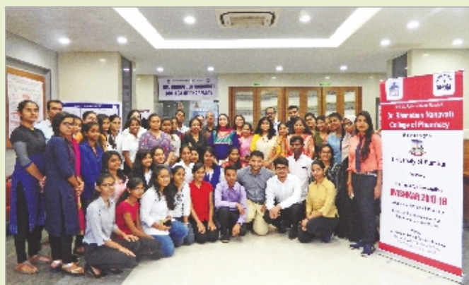
University Research convention, AVISHKAR 2017 hosted by BNCP