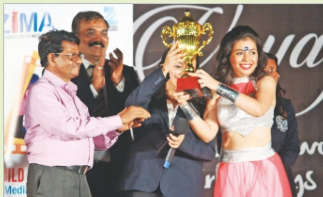
Best College for 6 th time in a row in Rx Festival organized by IPA-MSB