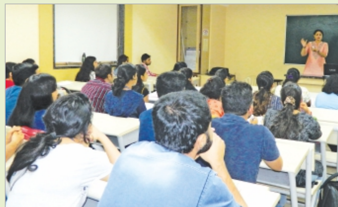
Guest Lecture by Industry Experts