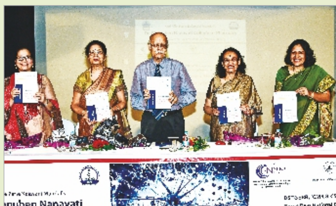
National Conference on "Neurodegenerative diseases: Strategies of drug discovery and delivery to the brain", July, 2017