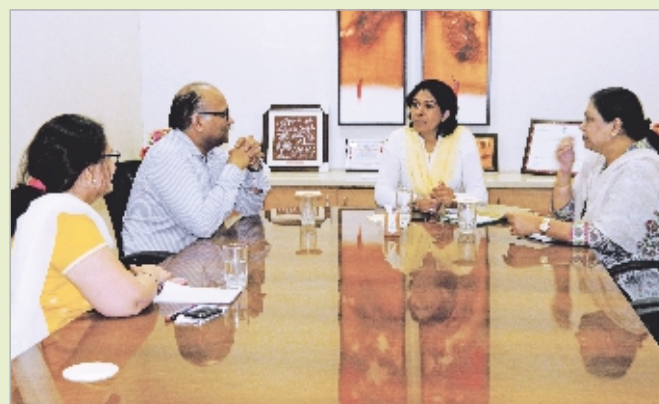
Visit of ACG Worldwide to BNCP