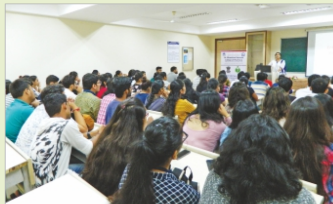
EntrePrerna 2017 (An Entrepreneurship Development Camp)