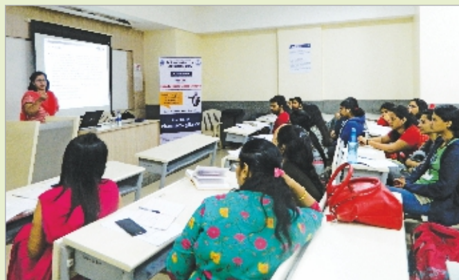
Industry Expert as a resource person for “Short term Certificate Course” offered by BNCP in association with Indian Society for Clinical Research