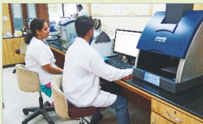
Faculty Training in Industry