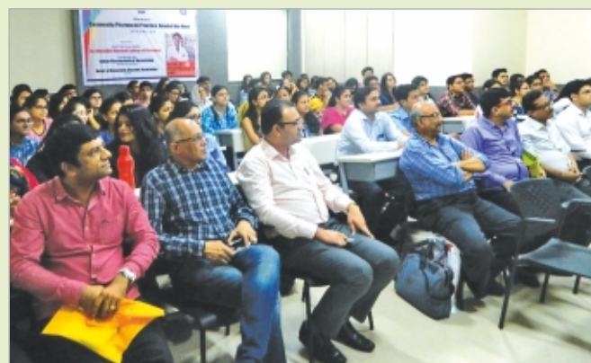
Workshop on "Community Pharmacist" on occasion of Pharmacist Day Celebration