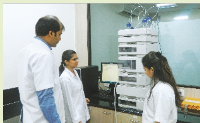
Training to Research Scientist of Ardmore Therapeutics by BNCP Faculty