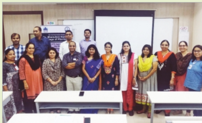
Faculty Development Programme, Dec 2017