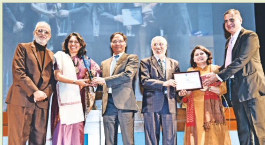
Best Industry-Linked Pharmacy College (Established Category) Award by AICTE-CII survey 2017