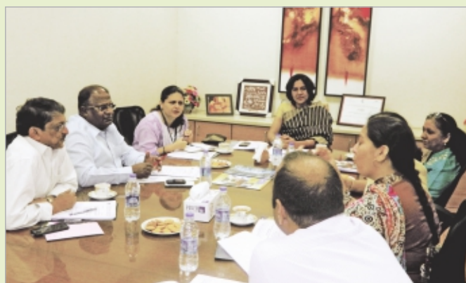
Industry advisory Committee meet