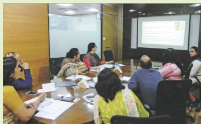
Research review meeting