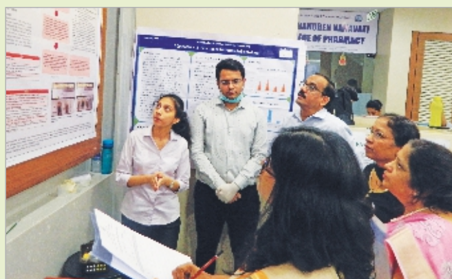
Poster presentation by students at University Research Convention "Avishkar 2017-18"