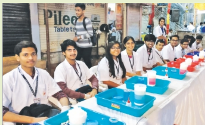
Blood Donation Camp by PHO Cell of the college