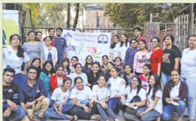
Dayitva, a Social Sensitivity Cell of the College organises campaigns