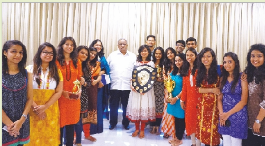
President of SVKM with the Principal and Winner of Rx Team of BNCP